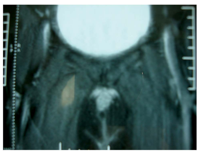
Figure 3. MRI Pelvis T2 weighted image showing hypointense muscle laver

MRI (figure 3 and figure 4) pelvis confirms the origin of the lesion. A nearly ovoid mass arising from the lower margin of urethra and bulging into the vaginal cavity minimally hyperintense on FSET2WI, STIR with mild to moderate enhancement. The lesion measures approximately 20x16x25 mm. The muscle layer appears hypointense on FSET2WI.