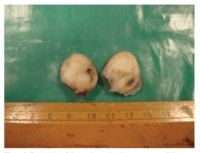
Figure 5. Cut section of the specimen showing tumour as solid encapsulated tissue