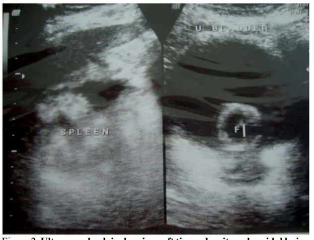
Figure\ 2.\ Ultrasound\ pelvis\ showing\ soft\ tissue\ density\ polypoidal\ lesion\ seen\ in\ anterior\ vaginal\ area\ arising\ from\ posterior\ urethral\ wall