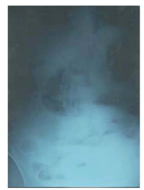
Figure 4. Abdominal X-ray showing dye not crossing caecum after 24 hours

There were 10 patients in group B and the surgical management remained the mainstay of successful treatment. Six (60%) patients required surgery and 4 patients (40%) resolved conservatively. While in Group A, 13 (65%) cases were treated conservatively and 7