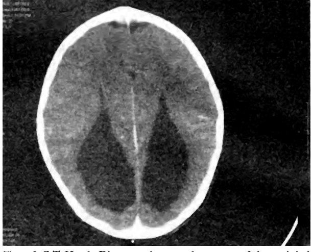
Figure 2. C.T. Head - Disproportionate enlargement of the occipital horns of the Lateral Ventriclesthe Lateral ventricles. Highly placed 3rd Ventricle.