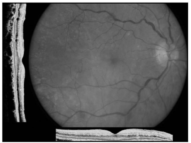
Figure 3. Optic fundus showing dilated and sausage shaped retinal Vein

Fundus shows venous dilatation and sausage shaped retinal veins and renal involvement is minimal. The eye manifestations of Macroglobulinemia can include midperipheral hemorrhages, sludging of blood in the conjunctival vessels, blurred disc margins, exudates in the fundus and serous retinal detachment.