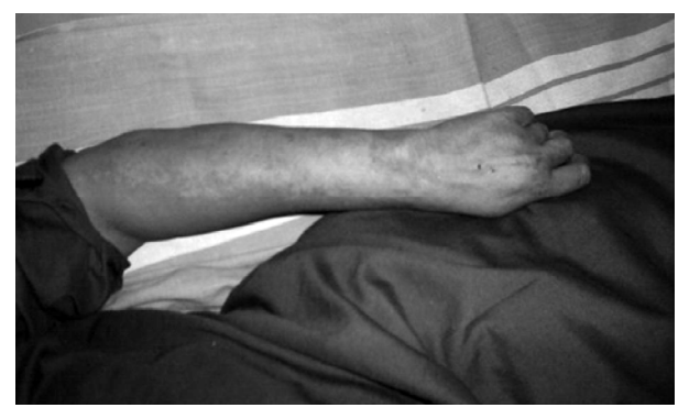
Figure 1. Showing port wine stain left upper limb

Thirty eight year old woman presented with first episode of focal seizures involving right side of the face and right upper limb for two days duration with out loss of consciousness. She is a diabetic and hypertensive on treatment for the past two years. Her facial appearance has been changing for the past ten years due to thickening of lips and increasing size of the nevus on the left side of the face. She had lost vision on her left eye a year ago, when she was diagnosed to