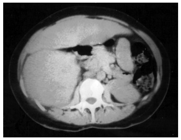
Figure1. CT scan of Abdomen showing large right adrenal mass

On examination she had a Karnofsky Performance status of 70. Pulse rate was 88/minute and B.P.170/90 mm of Hg. She had extensive acne and hirsuitism. There was no significant lymphadenopathy. Chest was normal. Abdomen was distended with a 15-cm right-sided abdominal mass, which moved little with respiration. There was no evidence of free fluid. Investigations revealed haemoglobin of 9.6 gm%, WBC